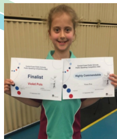
Top: Finalists - ES1 S1 S2 S3. L: Winner S1. R Winner S1