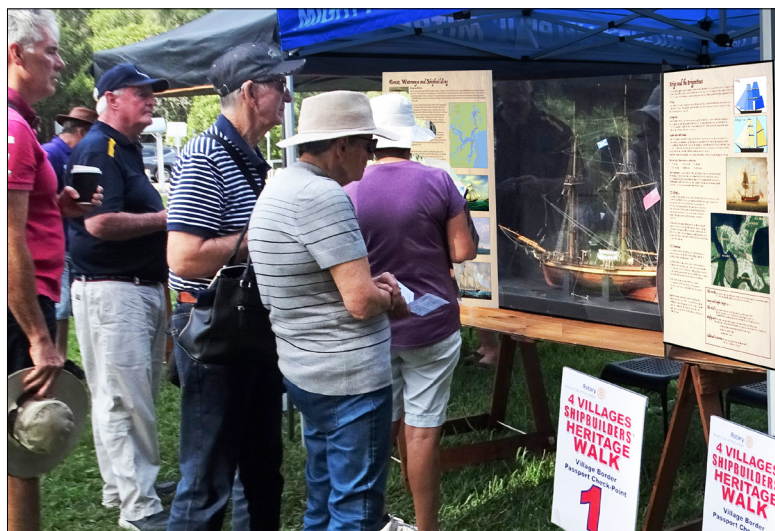
Above: Five specially developed historical displays about the ships and the shipbuilders of the 3 Villages area drew a lot of interest.