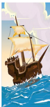
Chart a course for the... 4 Villages - Shipbuilders Heritage Walk Sunday 21 May 2023 shipbuildersheritagewalk.com.au Put it in your Log Book Now