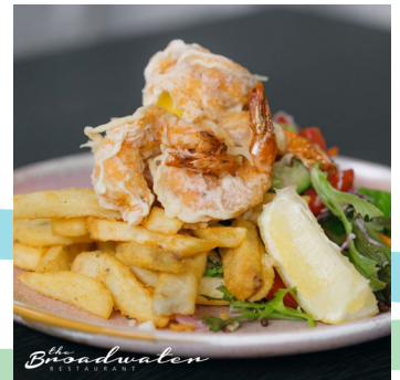
Above L to R: Brisket & cheese pie Israeli salad Pork schnitzel burger Salt & pepper prawn cutlets