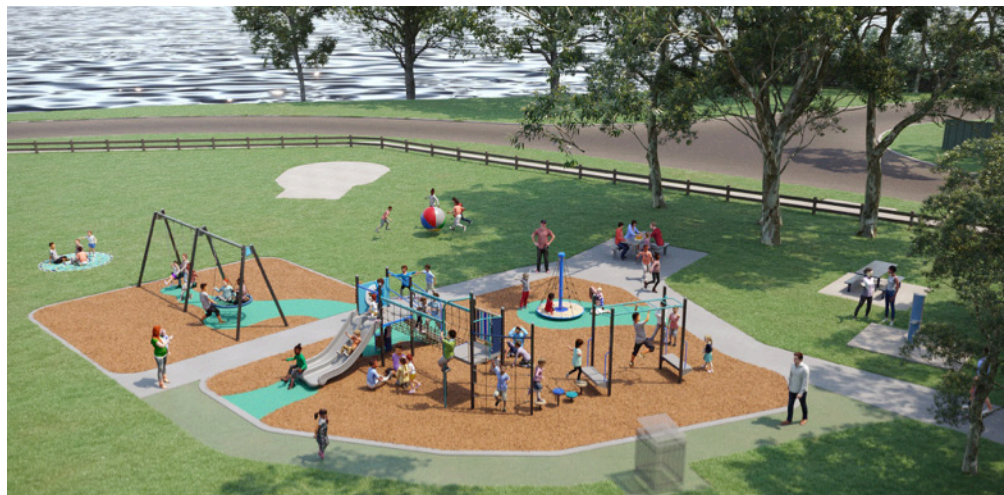
Above: The 3VCG will be contributing the extra path seen in the front to ensure the scooter path circles the playground, as well as an additional swing.

With quite a scenic bike and walking track from Davistown to Kincumber you can find a pretty good playground towards the Kincumber end. The Alloura Waters walking track is a little hidden gem and it starts at the Davistown waterfront, then heads west along the foreshore and walks around to Lintern St Wharf. If you have never walked it, perhaps it's time to see how beautiful it is. Another, is the walk from