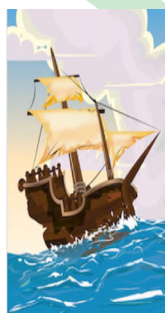
Chart a course for the... 4 Villages - Shipbuilders Heritage Walk Sunday 21 May 2023 shipbuildersheritagewalk.com.au Put it in your Log Book Now